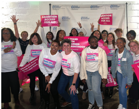
PPMNJ team dances for repro rights

Over 70 PPMNJ Board of Trustees, staff and allies including Planned Parenthood Federation of America's President and CEO Alexis McGill Johnson gathered at the Montclair Museum in June to acknowledge that our fight continues to ensure reproductive healthcare rights for everyone.