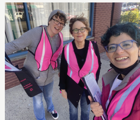
Advocacy team and volunteer engaging our communities

PPMNJ's Health Care Advocacy Program (HCAP) continued throughout 2022. Volunteers engaged patients, asking them to share their thoughts on abortion access, reproductive rights, and their experiences at Planned Parenthood via an interactive art project.