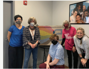
Advocacy and Public Affairs team with HCAP volunteers

PPMNJ's Health Care Advocacy Program (HCAP) continued throughout 2022. Volunteers engaged patients, asking them to share their thoughts on abortion access, reproductive rights, and their experiences at Planned Parenthood via an interactive art project.