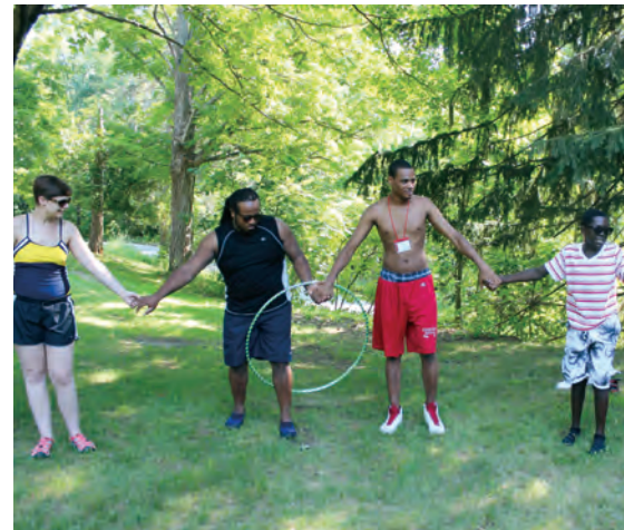
Equinox and UHPP S.T.A.R.S. peer educators and staff at Silver Bay

A summer of exciting activities continued with visits to Hunter College and the American Museum of Natural History in New York City in July, and to SUNY Cobleskill and Hartwick College