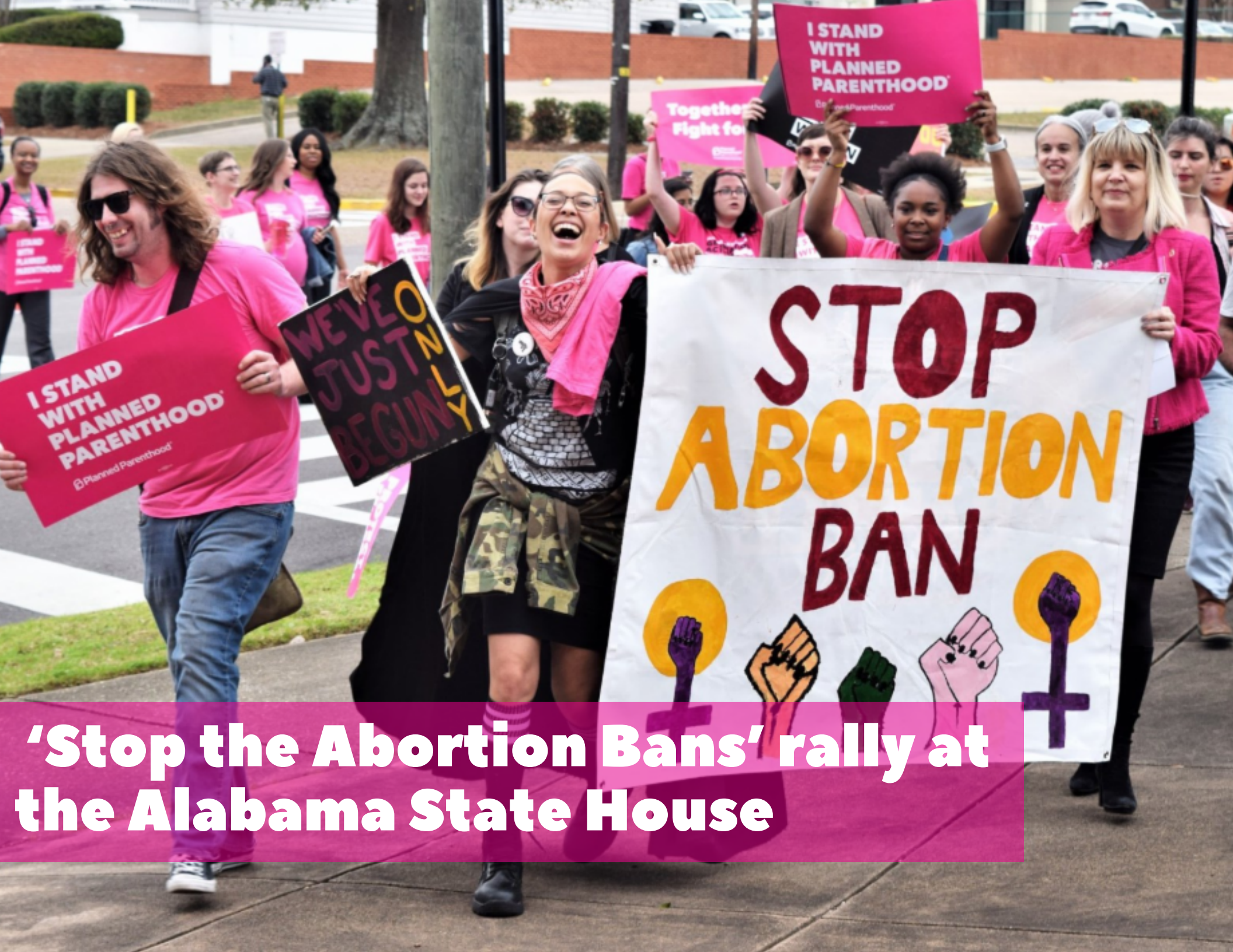
'Stop the Abortion Bans' rally at the Alabama State House