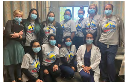
Pictured above: San Rafael team on their first go-live day.

Furthermore, our health center workflow will improve through tools such as secure collaboration and information sharing between clinicians, quick access to patient records through the MyChart application, and seamless integration across all functional areas. PPNorCal will be an even more attractive and competitive health care option for patients seeking care and clinicians seeking employment. We are very proud of what we have been able to accomplish over the last few months!