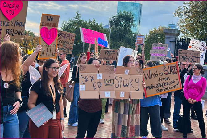
Group of sex education advocates at the "Sex Ed Isn't Spooky" rally in Boston on October 25th

The FY23 PPLM Annual Report is available online! We invite you to learn more about the work your investment in PPLM made possible by visiting pplm.org/FY23AR .