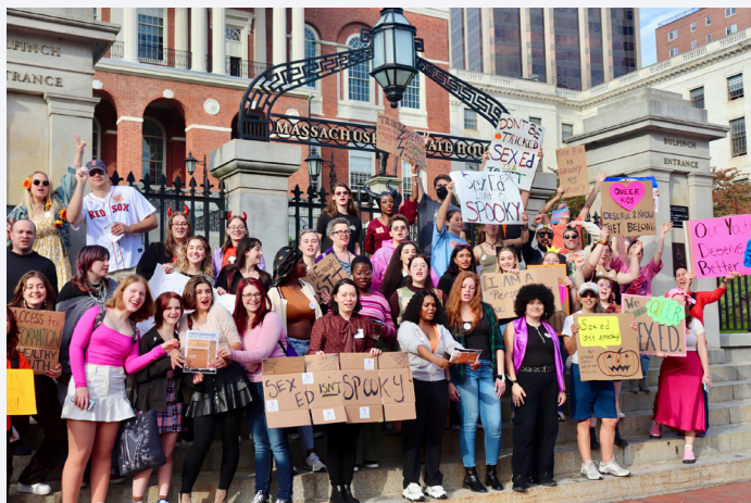
Young people and sex education advocates gathered in front of the Massachusetts State House to send a message to legislators that "sex ed isn't spooky" on October 25th

Ten years ago, publication of a similar evaluation of PPLM's middle school curriculum demonstrated that Get Real is one of the few comprehensive sex education curricula that effectively delays sex and reduces risky sexual behavior among both boys and girls. Congratulations to PPLM's Education Team!