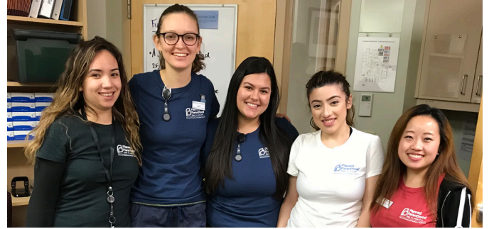
PPNorCal staff were recipients of the t-shirts.