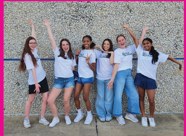
Photo (Right): Dallas area TACT students inspiring empowerment and positive change.

For 40 years, Planned Parenthood's TeenAge Communication Theater (TACT) program has been a cornerstone of peer-led sex education in North Texas. Through engaging performances by TACT teens, countless young people are empowered with the knowledge and confidence to make timely informed decisions about their sexual health. Peer education programs like TACT would not exist without the generous support from you, our donors. Your contributions ensure TACT's legacy of empowerment, education, and positive change for our communities.