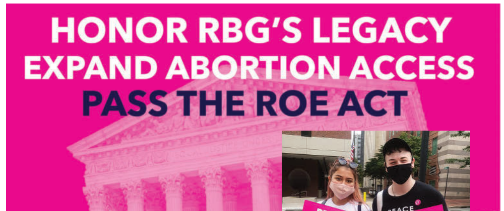
Right: PPAF supporters at a press conference denouncing the nomination of Amy Coney Barrett to the U.S. Supreme Court in September.

While the provisions do not exactly match the ROE Act, they do reduce barriers to care for a significant number of people. Among their many reforms, the provisions allow young people aged 16 and 17 to make their own decisions about abortion care without having to go before a judge, and allow remote hearings for those under 16. With this reform, Massachusetts has become the first state to legislatively ease