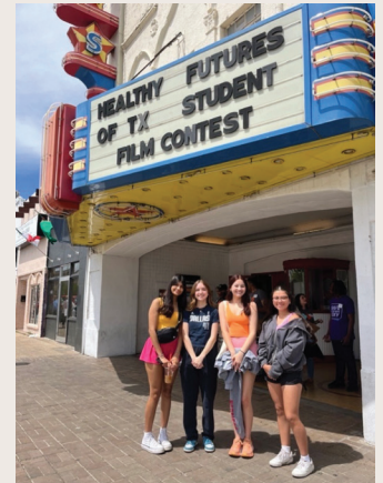
Photo (right): Dallas Teen Advocate Board participants attend a teen film screening in April.