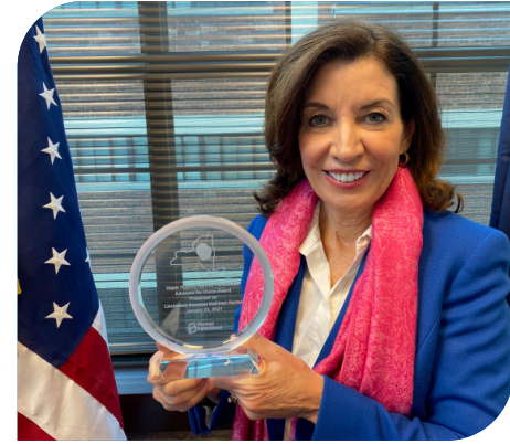
Our 2021 Advocate for Choice winner Lt. Governor Kathy Hochul