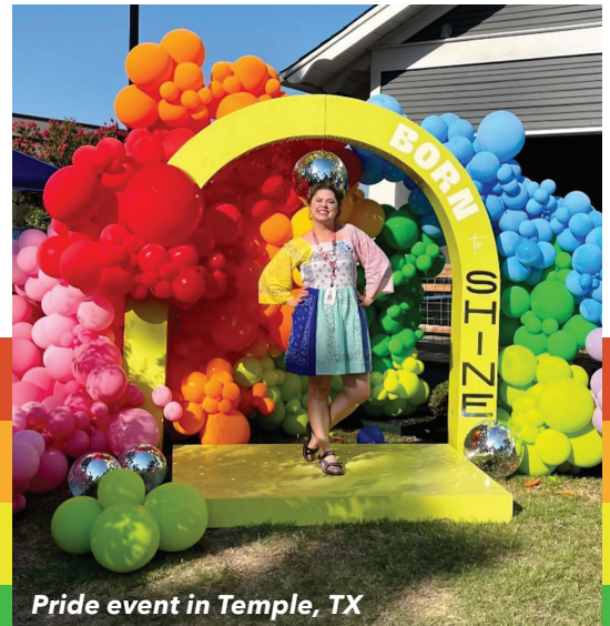
Pride event in Temple, TX