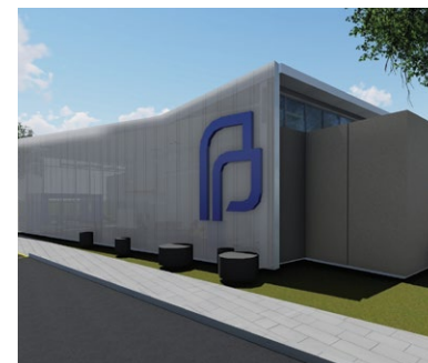
Architectural renderings of the new Reno health center