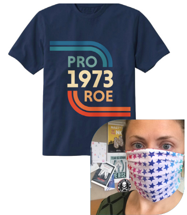
MASKS4PEOPLE, a project out of Catskill, NY, made and donated cloth masks to UHPP, including the one pictured here!

As you consider your philanthropy in the coming months we want to update you on potential charitable giving tax deduction incentives now in place. Under the 2020 CARES Act, you can now deduct up to $300 in charitable giving on your 2020 tax return, even if you take a standard deduction.