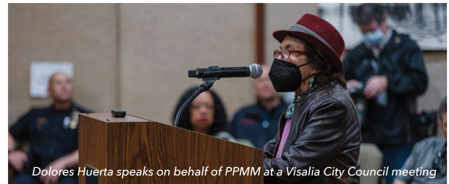
Dolores Huerta speaks on behalf of PPMM at a Visalia City Council meeting

Right away, our Public Affairs team rallied a crowd of local PPMM supporters, including faith leaders, young people, and legendary labor leader, Dolores Huerta. They lined up for hours at the podium during a recent Visalia City Council meeting to passionately explain the community's urgent need for the new health center.