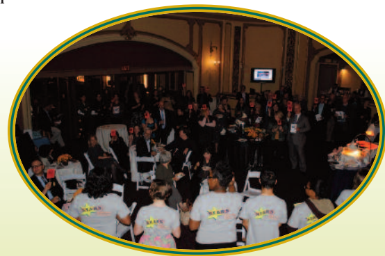
Above: S.T.A.R.S. peer educators at the “Condom Nation Celebration” event at the Palace Theater in Albany.