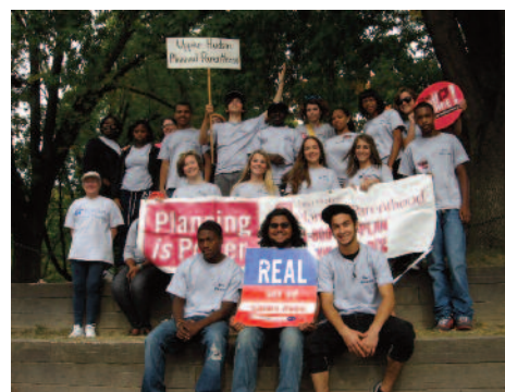
S.T.A.R.S. peer educators from Albany and Columbia counties at AIDSWalk.

• Similarly, the City of Hudson Youth Department has enabled our Columbia County S.T.A.R.S. program to offer a drop-in mentoring program for girls ages 7 to 13. The program is offered as one of several activities available to youth who come to the Youth Department building on Fridays from 4 to 5pm. ●