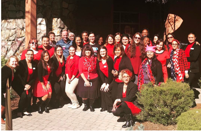
A proud moment at our Concord administrative office as staff showed their support for "A Day Without a Woman".

On International Women's Day, March 8, Planned Parenthood Northern California stood in solidarity with the "A Day Without a Woman" protest. Many of our staff wore the color red in solidarity of this protest, to elevate the importance of women's issues in this country and abroad.