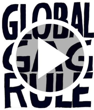
The Global Gag rule signed by President Trump promises to be devastating to millions of women and children worldwide.

On his first day in office in January, President Trump reinstated a policy that bans U.S. foreign aid to providers who discuss abortion as a family planning option. The ban was first put into place in 1984 by then-President Reagan.