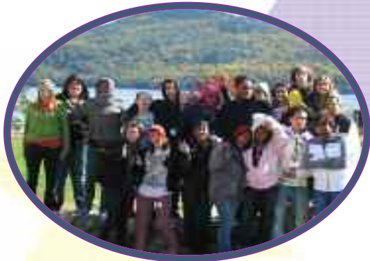
Albany and Columbia County S.T.A.R.S. Peer Educators at Silver Bay in the Adirondacks for an educational retreat.