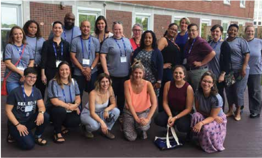
Above: PPLM and Planned Parenthood of Southern New England (PPSNE) staff at the national Planned Parenthood Deeper Well education conference in August, which PPLM co-hosted. Right: PPAF and NARAL Pro-Choice Massachusetts staff at the ROE Act legislative hearing at the Massachusetts State House in June. Bottom: PPAF volunteers and supporters at the Boston Pride March in June.