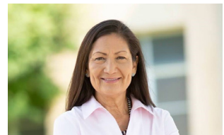
Representative Deb Haaland

PPVC hosted Champions of Choice on August 6, featuring the amazing speaker Representative Deb Haaland of New Mexico. Sixty-seven supporters joined us, raising over $68,000 for PPVC's critical pre-election work. This year's Champion of Choice honorees included Colorado Governor Jared Polis and Planned Parenthood of the Rocky Mountains' Solidarity Workgroup.