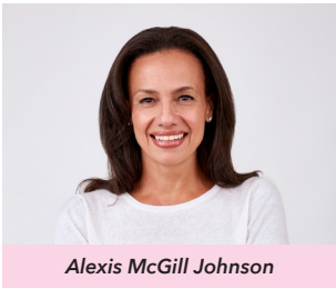
Alexis McGill Johnson