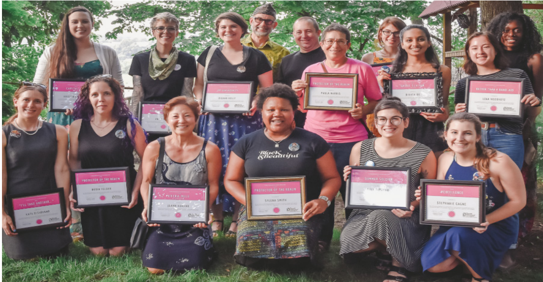
Volunteer Appreciation Event at Choderwood