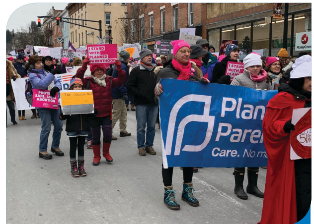
UHPP at the Women's March On Hudson!

UHPP launched The Campaign for Upper Hudson Planned Parenthood: A Place for Everyone , to raise $7.2 million to support sexual health care services and education in Albany, Columbia, Greene and Rensselaer Counties. In 2017, UHPP initially set out to raise $5.5 million for this campaign. However, at a time of unprecedented attacks on the services UHPP provides - contraceptive care, abortion, STI testing and treatment, and transgender care - we made the decision to increase our goal to $7.2 million to ensure continued access to these services in our region. Since the launch of our campaign, we have been humbled by the incredible generosity in our community. To date we have raised over $4.5 million.