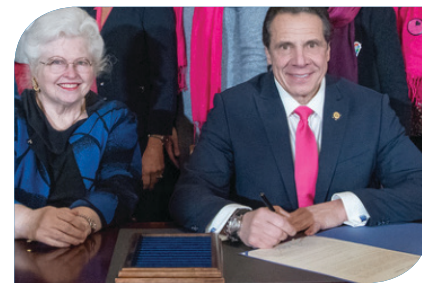
Sarah Weddington and Governor Andrew Cuomo

Governor Andrew M. Cuomo signed the Reproductive Health Act (RHA) into law on Tuesday, January 22, the 46th anniversary of Roe v. Wade. RHA protects reproductive rights and access to abortion by ensuring New Yorkers can make personal health care decisions and medical professionals can provide crucial services without fear of criminal penalty. The legislation codifies Roe v. Wade into New York State law. Advocates and supporters were on hand to celebrate the victory!